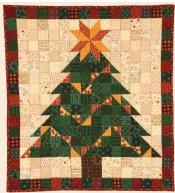
Free Pattern download

One is made with half square triangles. I use mine as a large wall hanging but add a few borders and you could use it on your bed! One is made using the Creative Grids curvy and regular log cabin trim tools, and the other is a small applique to go on a towel or pillow top. Start digging out your scraps for one of these fun projects.