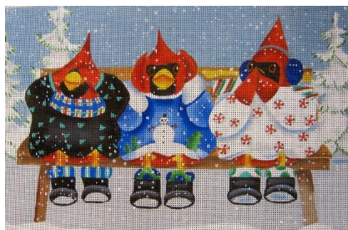
"No Evil" Cardinals $111 HSN designs Handpainted on 18 mesh canvas Total canvas size 11 x 15