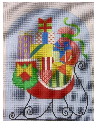
Tis the Season Sleigh $85 Brenda Stofft design. Handpainted on 18 mesh canvas. Total canvas size 9 x 10