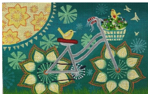
Bicycle with Birds $105 Love You More Designs. Handpainted canvas on 18 mesh. Total canvas size is 9 x 13.