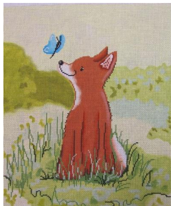
Baby Fox and Butterfly $184 Patti Mann Designs Handpainted on 18 mesh. Total canvas size 14 x 16