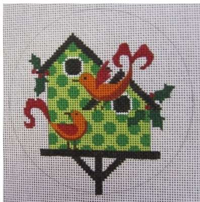
Green Birdhouse $48 JP Needlepoint Designs Handpainted on 18 mesh canvas. Total canvas size 10 x 10