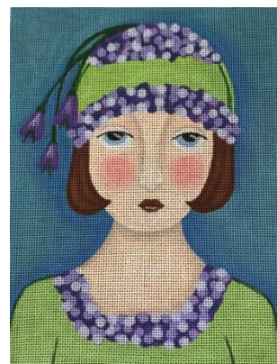
Hydrangea Girl $96 Love You More Designs. Handpainted on 18 mesh. Total canvas size is 11 x 13.