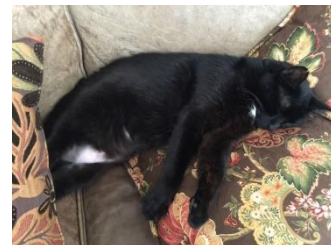
The real B.B. King