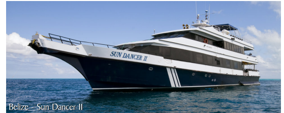
Belize - Sun Dancer II

We'll be diving in the western hemisphere's largest barrier reef with amazing marine life. There are a great number of pelagic fish such as sharks and rays, and also commonly seen are turtles and lobsters.