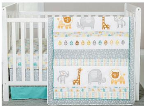
Bed Bath &amp; Beyond