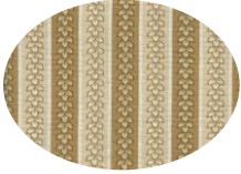
Piece C – Inner triangle Cut (4)