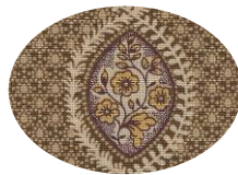
Piece A – Center Cut (4)