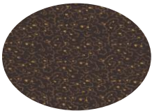
Piece E – Stars Cut (8)