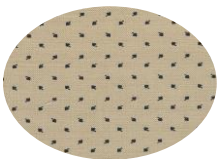
Piece D – Outside triangle Cut (4) AND Piece B – Corner squares Cut (16)