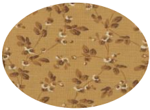
Piece C – Inner triangle Cut (4)