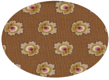
Piece A – Center Cut (4)

Month #7 – Make 4 blocks from each set of fabrics