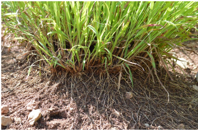
The roots are showing on plant where erosion has taken place.