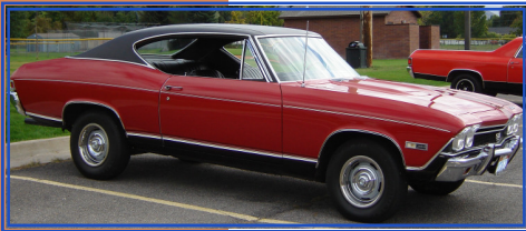
Winner of the 2011 Pride of Providence Award

Come and vote for your favorite People's Choice Award!