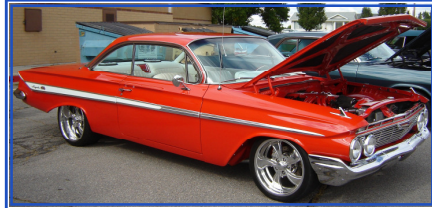
Winner of the 2011 People's Choice Award

Register your vehicle by October 11th to participate in the 5th Annual Car Show.