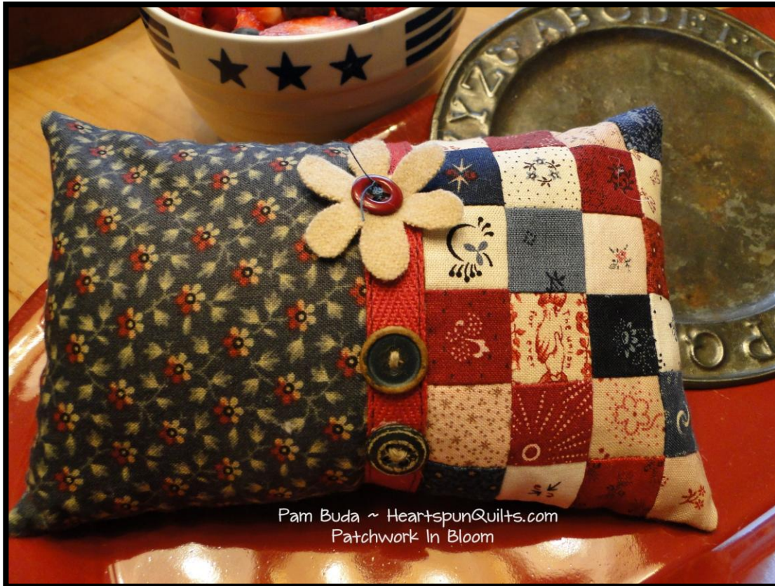
Pam Buda ~ HeartspunQuilts.com Patchwork In Bloom