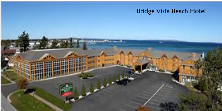
Bridge Vista Beach Hotel

Bridge Vista Beach Hotel—Mackinaw City, Michigan 1027 South Huron Street, Mackinaw City, MI $750.00 per Quilter - (dbl occupancy)