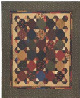
The Bee's Knees