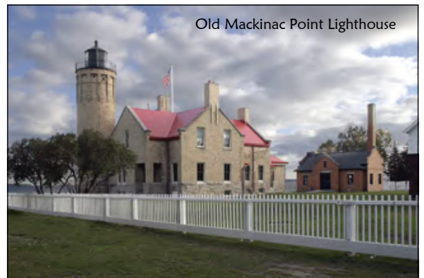
Old Mackinac Point Lighthouse