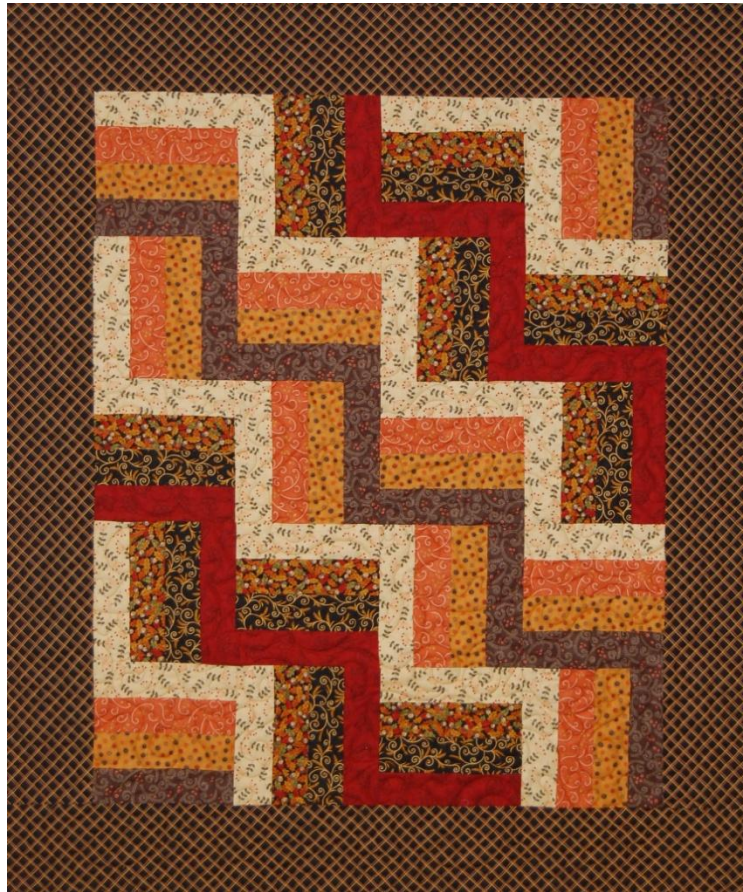
Jellyroll and Beginner Friendly Quilt!