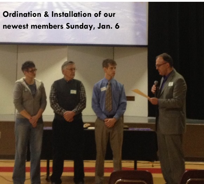
Ordination & Installation of our newest members Sunday, Jan. 6