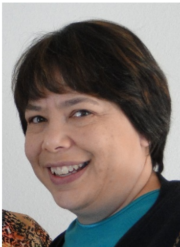
Off the Wall Quilt