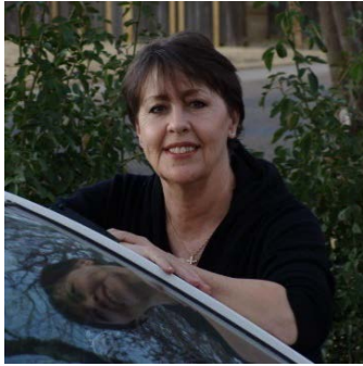
Crawford Designs "Sewing Made Simple" Patterns