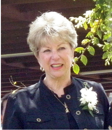
Bobbie G. Designs