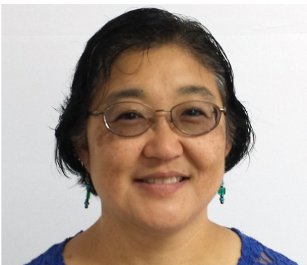
Pacific Fabrics www.pacificfabrics.com

I love to sew and quilt and I love to play with dyes and paints. I have a BA in Mathematics and earned a teaching certificate from the University of Washington. I currently work for Pacific Fabrics in the Everett Location. I teach our Learn to Sew classes for adults and kids, as well as our Block of the Month Quilt Club in Everett. I teach a wide variety of classes including Fabric Dyeing and Fabric Marbling. My goal is to make learning to sew a fun, rewarding experience.