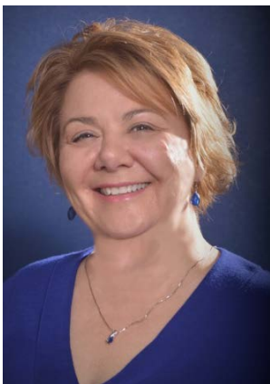
LoriAnne Pattern Collection