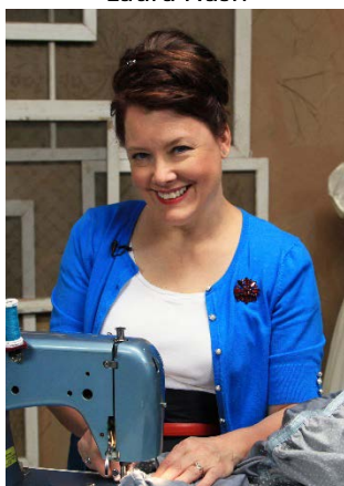
Sew Chic Pattern Co.