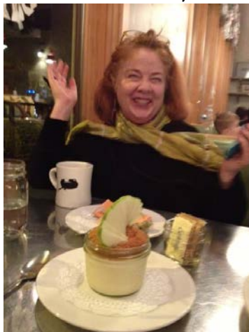
The Smuggler's Daughter www.smugglersdaughter.com