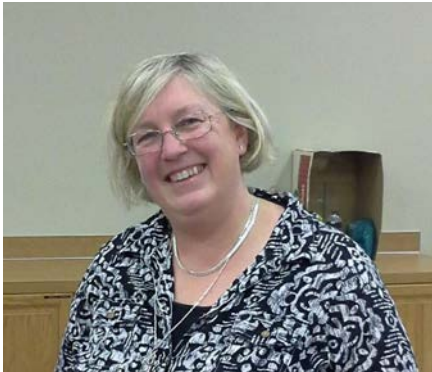
Clearview Designs www.clearview-designs.com