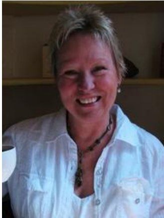
Rita's Best Designs www.ritasbestdesigns.com

Twelve years ago, my husband bought me my first embroidery machine and the software required to create my own designs for our anniversary. My life changed so much at that moment. I made designs, those became popular, and suddenly, a hobby became a business. My goal has been to make my embroidery machine work at its fullest, beyond simple embroidery. My machine now stitches out applique and/or piecing in the hoop. It also stitches out custom quilting in the hoop.