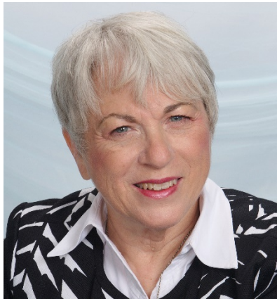
Fashion Patterns by Coni