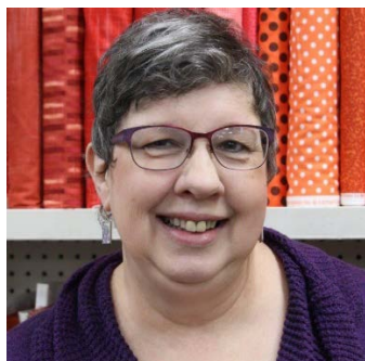
Pacific Fabrics www.pacificfabrics.com