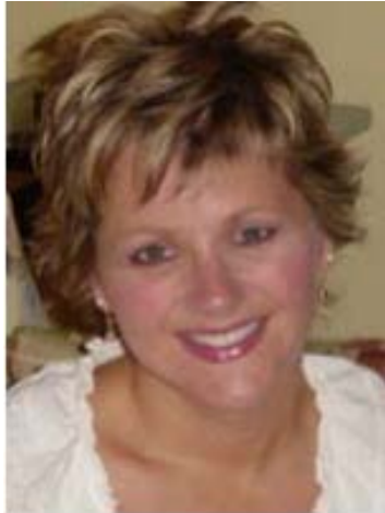
Labours of Love www.laboursoflove.com