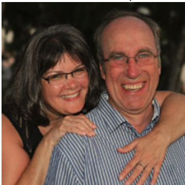
Wooden Spool Designs