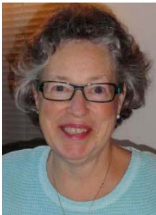
Clover Needlecraft, Inc.