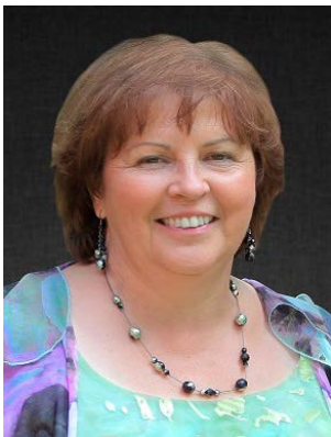
SVP Worldwide www.svpworldwide.com