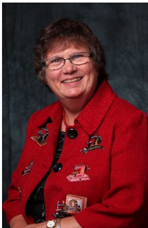
Sulky & Baby Lock