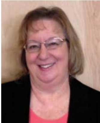
Calico Threads www.calicothreads.com

I studied Home Economics Education in college, and have worked in the sewing industry for over 23 years. I am currently co-owner of Calico Threads, a quilt shop in Tacoma, Washington. I have taught many sewing and quilting classes, and love to inspire both new and experienced quilters. Sewing is my passion!