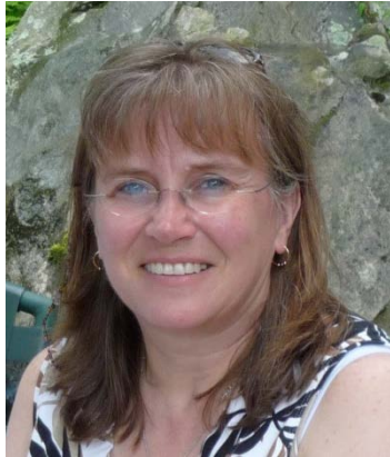
Pieceful Designs www.piecefuldesigns.com