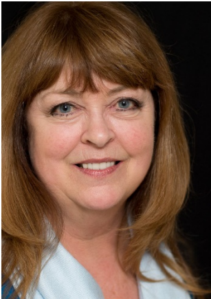
Ryliss Sewing & Design School www.sewinganddesignschool.com