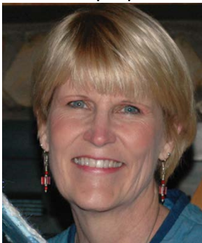
Sulky of America www.sulky.com