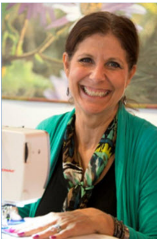
Bernina of America www.bernina.com