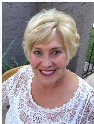
Crooked Nickel Quilt Designs www.crookednickel.com