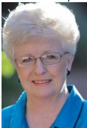
Two Easy Tape Co. / Lorraine Henry Enterprises