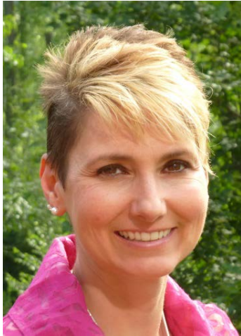
Sulky of America www.sulky.com