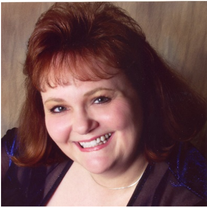
Sew Artfully Yours