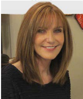
Silhouette Patterns, Inc. www.silhouettepatterns.com