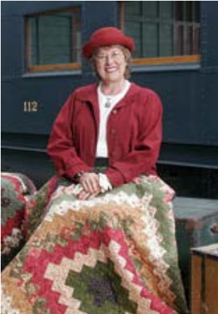
Quilt In A Day