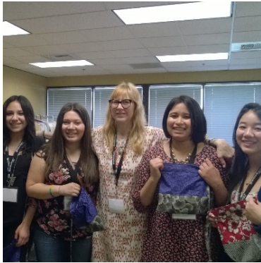
Paradiso Designs/Quiltworks Northwest www.paradisodesigns.com