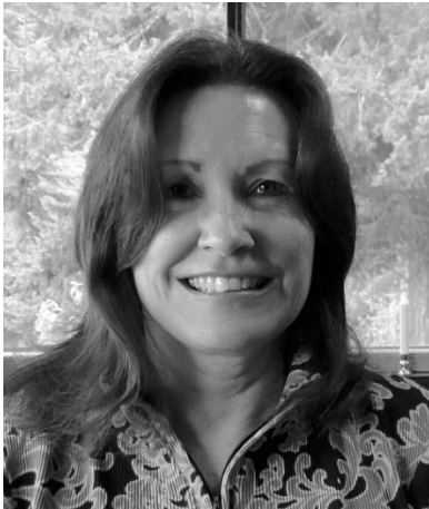
Sue's Studs & Stencils