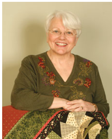
Michell Marketing www.frommarti.com