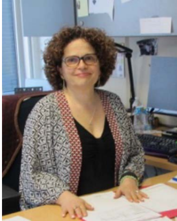
Simplicity Pattern Company www.simplicity.com

Simplicity Pattern Company has been my home for over thirty-six years. My passion for sewing equals my passion for being involved every day in the creation of our product. In my current position as Design Development Director, I am involved in every design, from selection through the finished product. Daily, I work with every Patternmaker, Seamstress, Writer, Illustrator, Quality Control Editor, and the Consumer Service Team. Every day I go to work with the goal of making sure that what we have created a sewing pattern can be successfully and happily sewn at home. I travel each year to Consumer Home Sewing shows where I interact with sewists of all backgrounds and skill levels and always love to hear their feedback and requests.