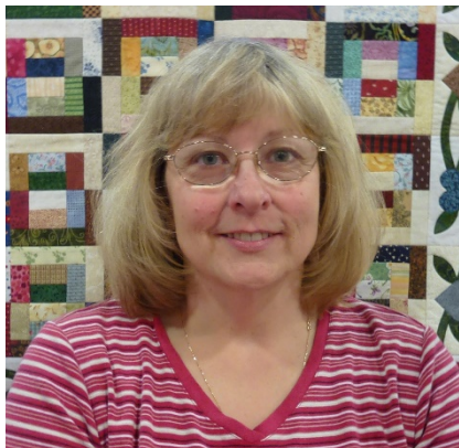
Flower Box Quilts