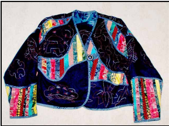
American Sewing Guild Olympia Chapter www.asg.com

This is a national organization of individuals who love to sew. The style show includes all types of garments plus displays quilts made by members. All ages and levels of expertise are represented.