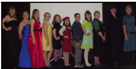
Valley 4-H Puyallup, WA