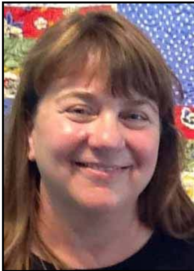
Lynnette Sandbloom Beach Garden Quilts www.beachgardenquilts.com