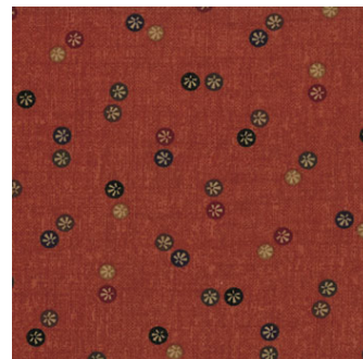
Kansas Troubles Club

Both the Flannel Club and the Kansas Troubles Club are quarterly clubs! Four times a year you will receive six fat quarters of the newest fabric in stock!