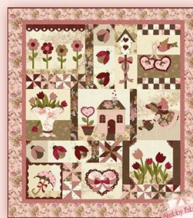
Blessings of Spring - Rebloomed!