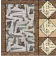
Make 1. (15" x 15" finished)

16. Sew unit from step 3 to unit from step 15. Press toward large, framed unit.