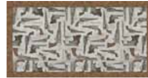
Make 1. (13" x 25" finished)