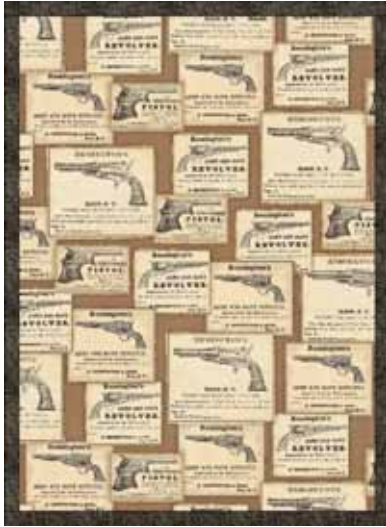
Make 1. (25" x 34" finished)