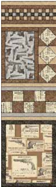
Left side of quilt.

17. Sew together in order: units from step 13, step 16, step 14 and step 2. Press.