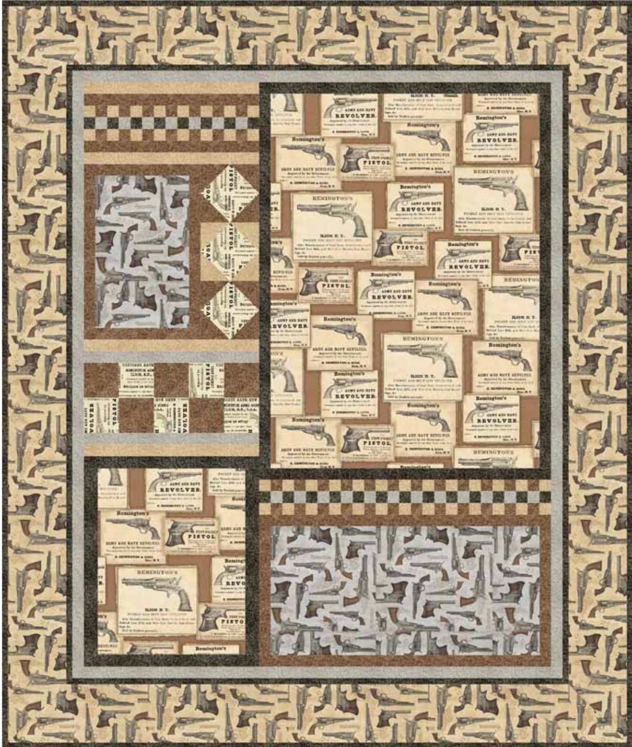
Designed By: Cyndi Hershey Finished Quilt Size: 53½" x 63½"