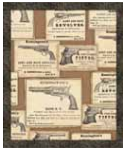
Make 1. (15" x 18" finished)