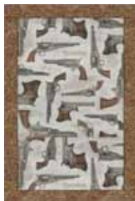
Make 1. (10" x 15" finished)