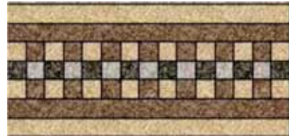
Make 1. (7" x 15" finished)