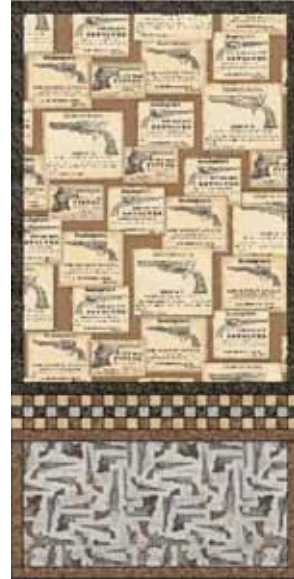
Right side of quilt.

18. Sew together in order: units from step 1, step 12 and step 4. Press.