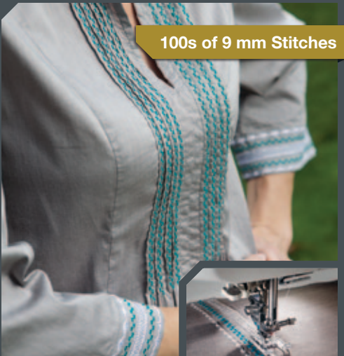
100s of 9 mm Stitches

You can move the needle to 91 unique positions in order to get pinpoint accuracy for decorative stitching, appliqué or fine quilt finishing. There is also a One-Touch quarter inch stitch setting that will make piecing faster and easier than ever. And, you can now direct select the left needle position for free motion quilting, giving you better control and precision. Add the Cloth Guide for long seams, and all your stitching will be beautifully precise every time.