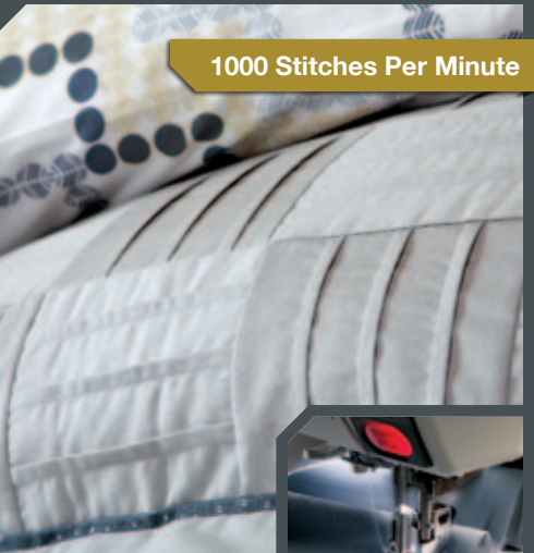
1000 Stitches Per Minute

The quiet power of this machine really shows itself when it comes time to sew multiple layers. Engage the exclusive AcuFeed Flex™ fabric feeding system and feel your project moving together under the needle with perfect precision. You get the same great results on quilts, thick home décor projects, even garments and accessories, such as matching plaid at a seam line or working with difficult fabrics, like micro-fiber. The AcuFeed Flex™ fabric feeding system is fully detachable and easy to remove when you're not using it. The twin foot is standard; a single foot is available as an option.