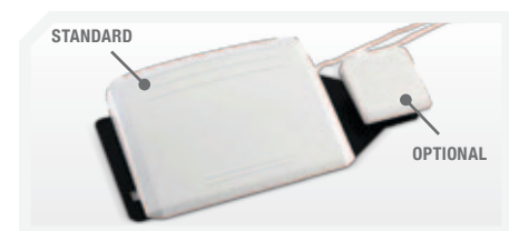
New Larger Foot Controller with Optional Remote Thread Cutter Pedal*

STANDARD WITH MC8900 QCP, OPTIONAL WITH MC8200 QC