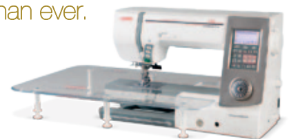
Large Extension Table

More standard and optional accessories means more ways to make your sewing and quilting easier and better than ever.