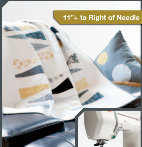
11"+ to Right of Needle