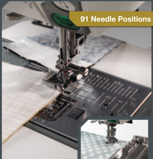
91 Needle Positions

You won't always want to sew that fast. But when you're doing a long straight stitch, it's nice to be able to finish it quickly—and know every stitch will be beautiful.