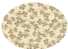
Piece D – Outside triangle Cut (4) AND Piece B – Corner squares Cut (16)