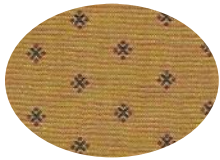
Piece C – Inner triangle Cut (4)