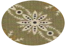
Piece A – Center Cut (4)

Month #4 – Make 4 blocks from each set of fabrics