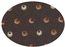
Piece E – Stars Cut (8)