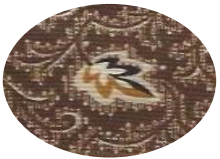
Piece A – Center Cut (4)