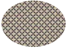
Piece C – Inner triangle Cut (4)