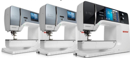
BERNINA 710 BERNINA 750 QE BERNINA 780