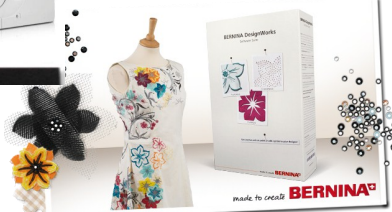
made to create BERNINA®