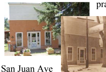
San Juan Ave