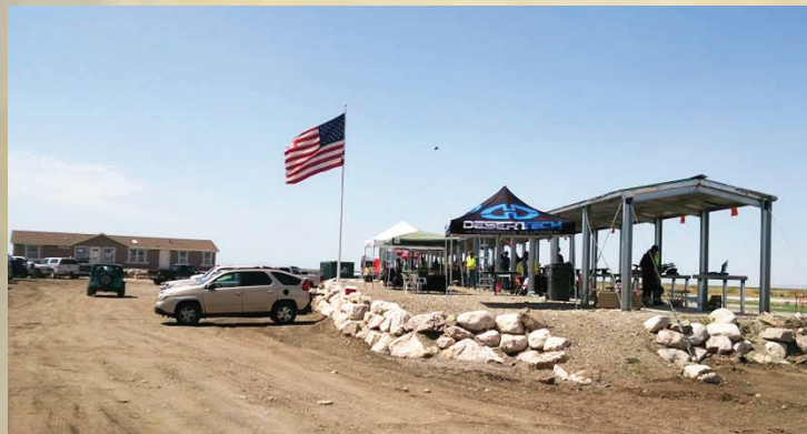
Three Mile Creek Shooting Sports Complex is a 20-bay, covered firing line, and is among the best facilities in the state of Utah, and the Intermountain West. It also features an on-site training facility.

The Three Mile Creek Shooting Sports Complex has something to offer visitors of every skill level. Youth come to learn gun safety and receive coaching on shooting techniques. Adults come to practice with, shoot, and sight in their guns at advanced distances. Skilled marksman come to compete in local, state, and national shooting competitions.