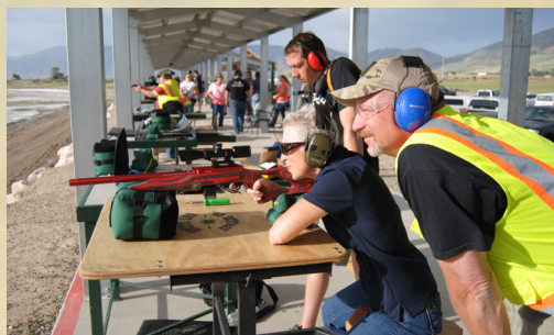
Range safety officers are always on to duty during public shooting hours to ensure a safe and family-friendly environment.