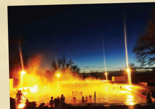
Natural Hot Springs