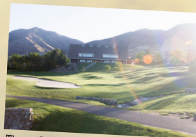
Three Golf Courses