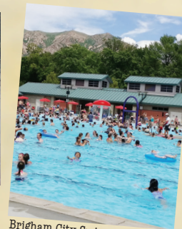
Brigham City Swimming Pool