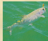
Fishing and Hunting