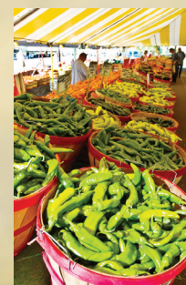
Historic Highway 89 Fruitway

visit www.perrycity.org for info & directions