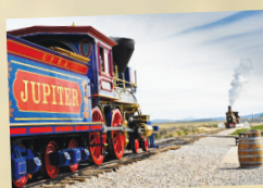
Golden Spike National Monument