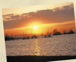
Willard Bay State Park

Experience the Old West and the great outdoors in a dozen different ways