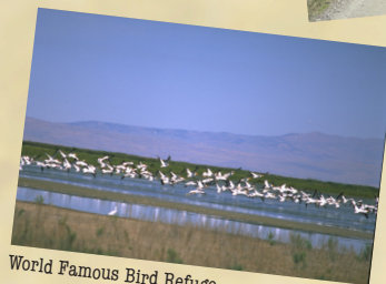
World Famous Bird Refuge