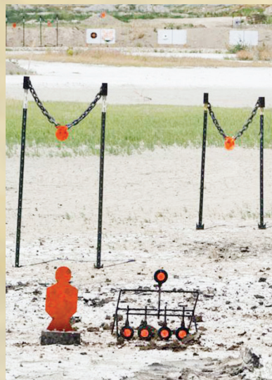
Three Mile Creek employs an advanced target system that will challenge experienced shooters, and provide fun feedback for beginners.