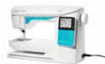
Husqvarna Viking Opal 850

At convention, Husqvarna Viking is introducing two new mid-line machines. The Opals are coming.