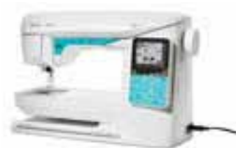
Husqvarna Viking Opal 870

Please Note: Effective with the December newsletter, we will no longer be mailing them. However, we will have printed copies available at each Sew What's New.