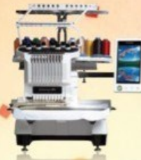
Entrepreneur® Pro PR1000e Enhanced 10-Needle Home Embroidery

With Purchase of Select Sewing & Embroidery Machines