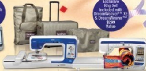
DreamWeaver™ XE Quilting, Sewing & Embroidery