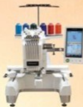
Entrepreneur® PR650e Enhanced 6-Needle Home Embroidery