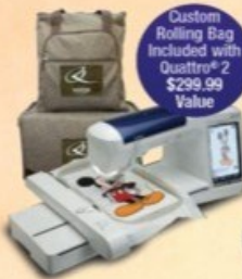
Quattro® 2 Embroidery, Sewing, Quilting & Crafting