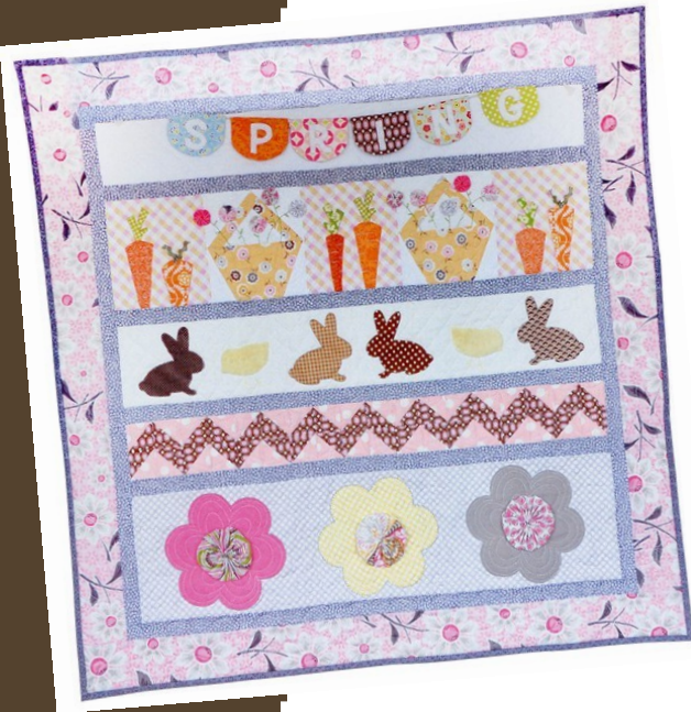
February: One Sweet Spring

The month's price will include all fabric needed to complete the top. Backing and batting must be purchased separately.