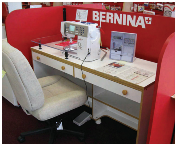
Our aurora 440 sits in a place of pride, underneath the Bernina logo.

Founded in Switzerland more than 100 years and four generations ago, Bernina has proven its reputation as the world's premier manufacturer of state-of-the-art sewing and embroidery systems, sergers and embroidery software.