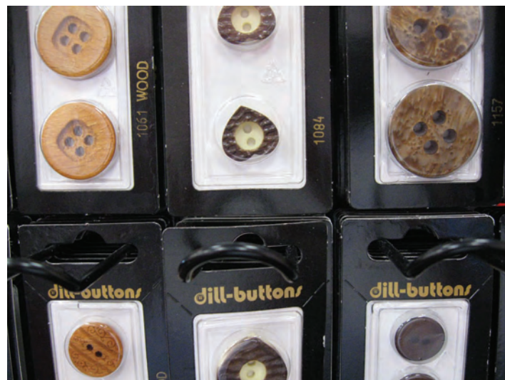
Several of the most popular Dill styles grace the button rack in Bernina Sewing Center.

Dill, a family-owned business founded in Bavaria, has grown from a small workshop to a state-of-the-art facility. The company has become one of Europe's most important manufacturers of fashion buttons, incorporating