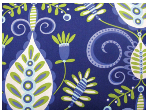
Large Whimsy Doozie