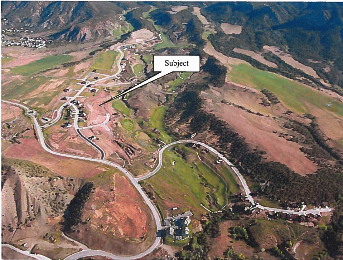
Project Location: Whitehorse Village Lakota Canyon New Castle Colorado