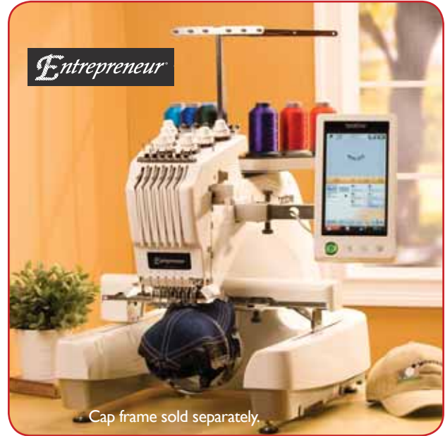
Cap frame sold separately.