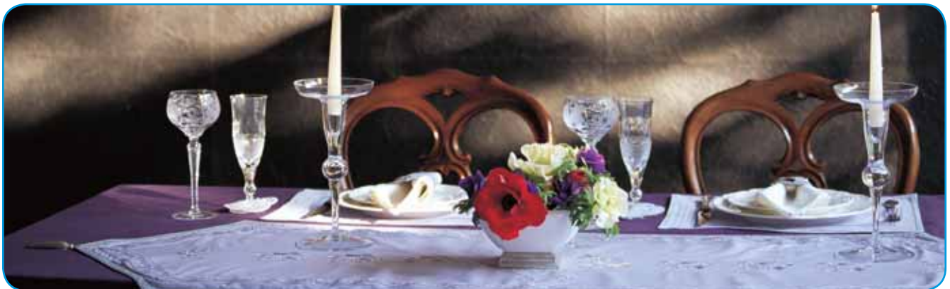
The BEST BUY SEAL is a registered trademark of Consumers Digest Communications, LLC, used under license.

* See www.brother-usa.com for list of compatible cards available for additional purchase.