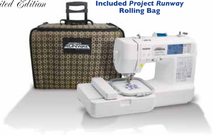
Included Project Runway Rolling Bag