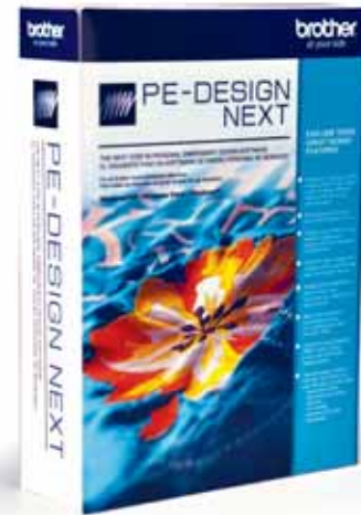
User-Friendly Graphical Interface