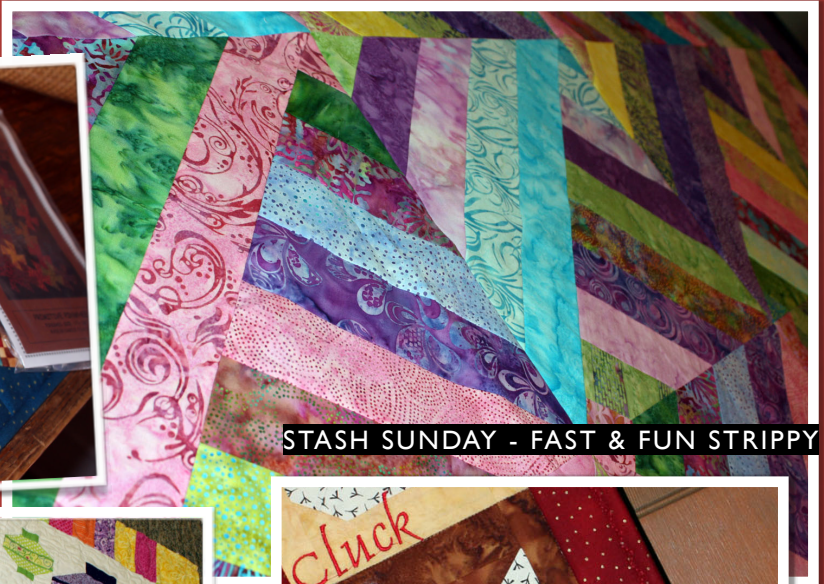
STASH SUNDAY - FAST & FUN STRIPPY