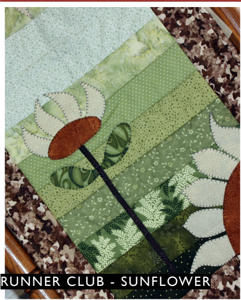
RUNNER CLUB - SUNFLOWER