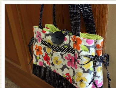
MINI BOW TUCKS PURSE