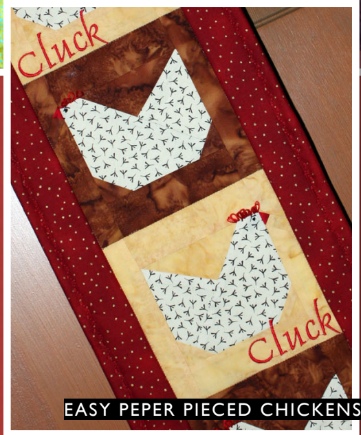
EASY PEPPER PIECED CHICKENS