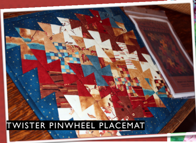
TWISTER PINWHEEL PLACEMAT