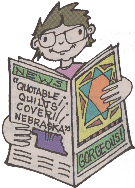
14 th Annual Nebraska Shop Hop