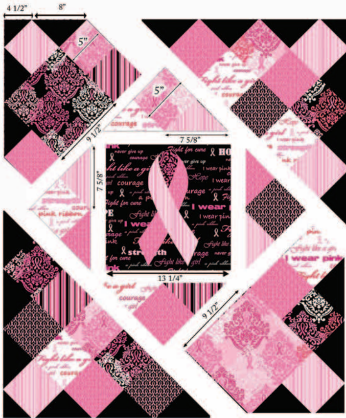
Quilt Assembly Diagram