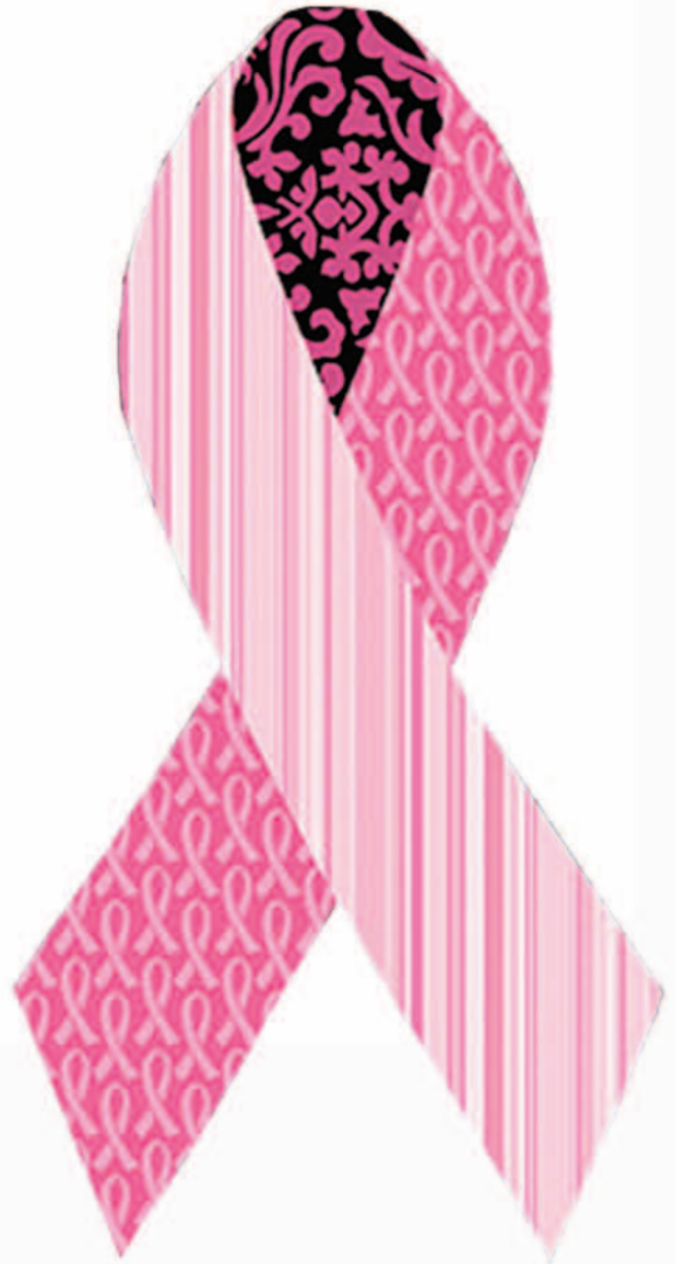
RIBBON TEMPLATE 1/2 SCALE