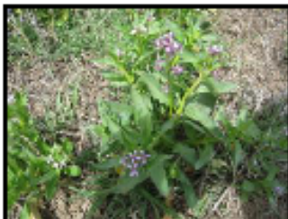
BLUE MUSTARD Nuisance