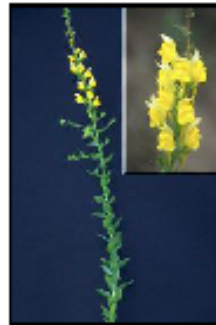
DALMATIAN TOADFLAX Class B