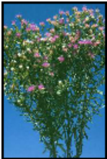
RUSSIAN KNAPWEED Class B