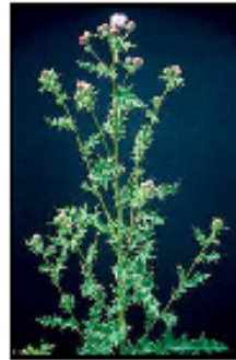
CANADA THISTLE Class B