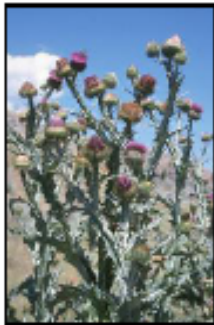
SCOTCH THISTLE Class B