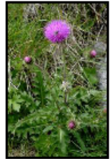
MUSK THISTLE Class B