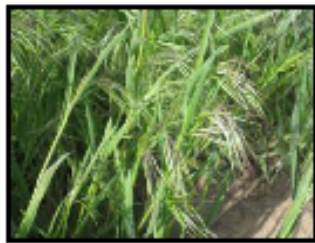
DOWNY BROME Nuisance