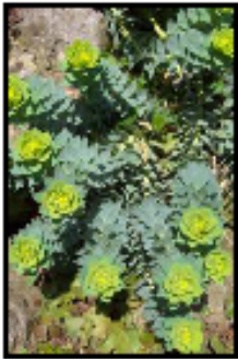
MYRTLE SPURGE Class A