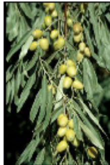
RUSSIAN OLIVE Class B