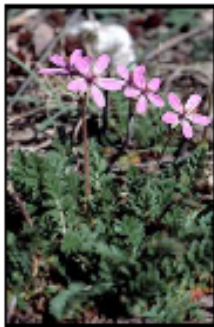
REDSTEM FILAREE Nuisance