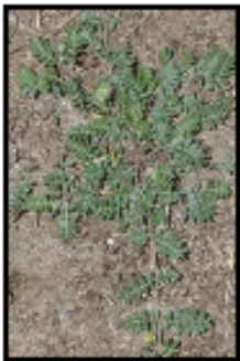
PUNCTUREVINE Class C