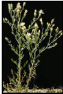
DIFFUSE KNAPWEED Class B