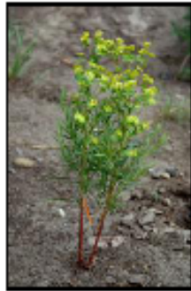
LEAFY SPURGE Class B