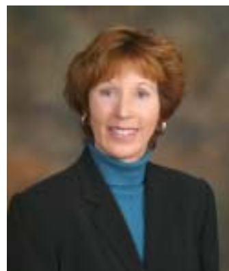
FOXFIELD RESIDENT SINCE 1996

Your home is your largest investment. Trust the sale to a broker with the knowledge and understanding of this unique and wonderful area.