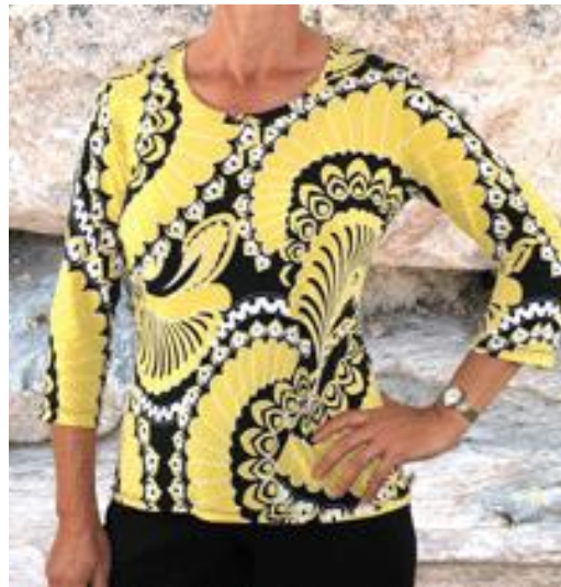
Tequila Pullover (left) and Champagne Pullover (right) by Brensan Studios