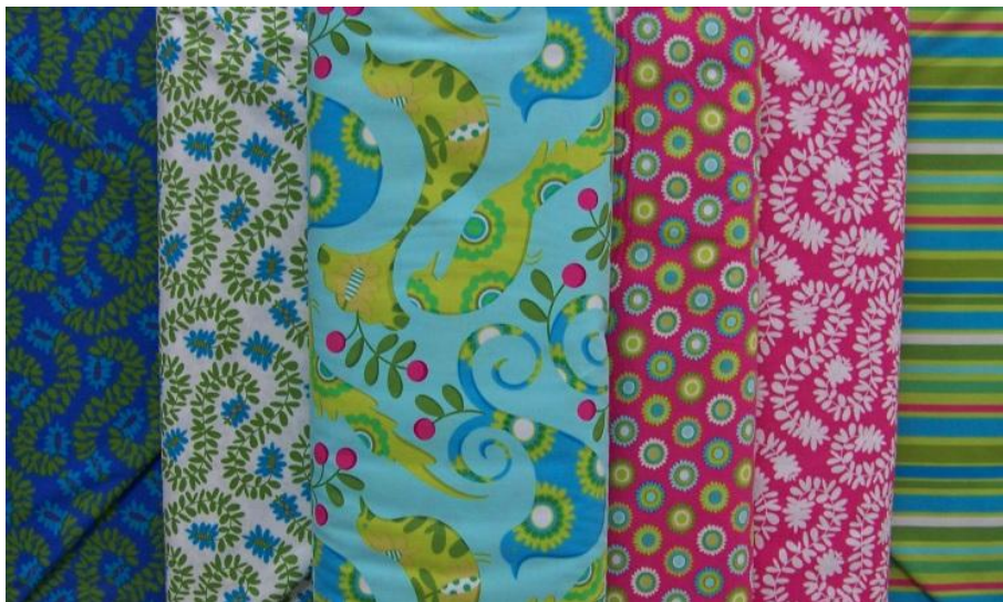
Pretty Bird and Meandering Vines by Michael Miller

Let's start off with the bright and whimsical Pretty Bird and Meandering Vines fabric by Michael Miller.