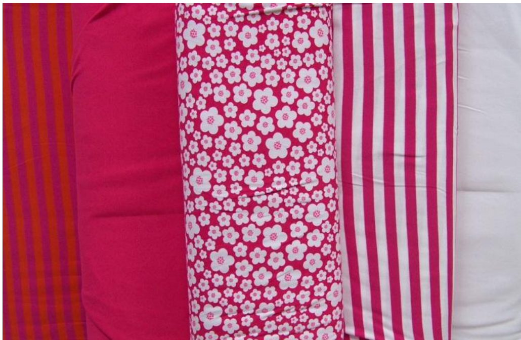
Knit fabric by Michael Miller in pinks and white

Garment patterns for making knit tops and skirts are also available. Here we have featured designs by Brensan Studios. These patterns have been designed specifically for stretchy material.