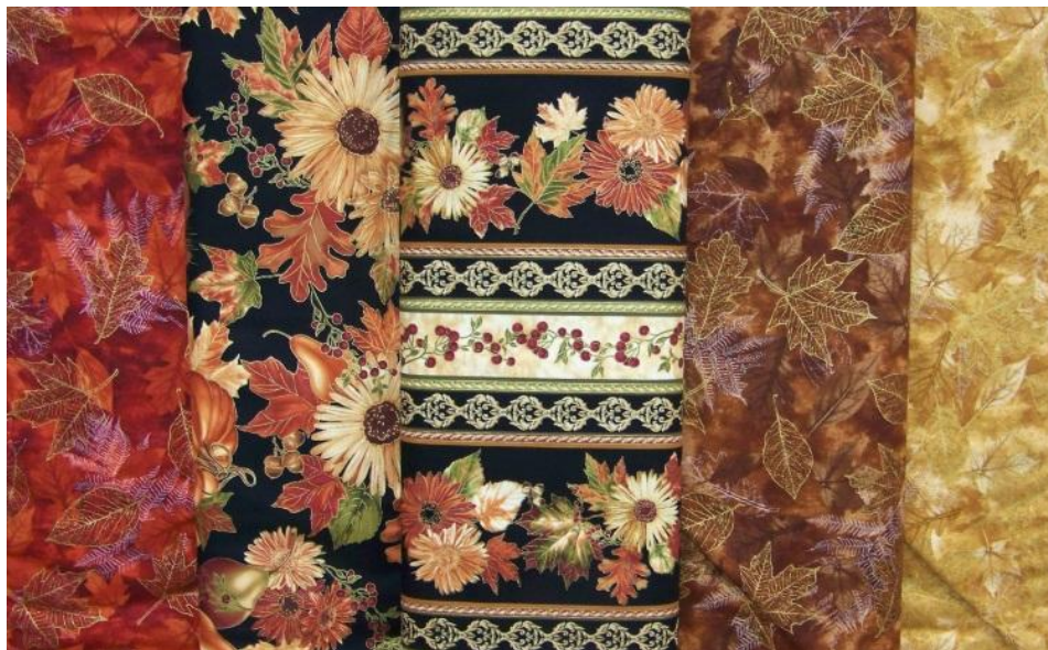
Harvest by Timeless Treasures

Our second fall collection has delicate leaf formations and is equally lovely. This is called Harvest by Timeless Treasures.