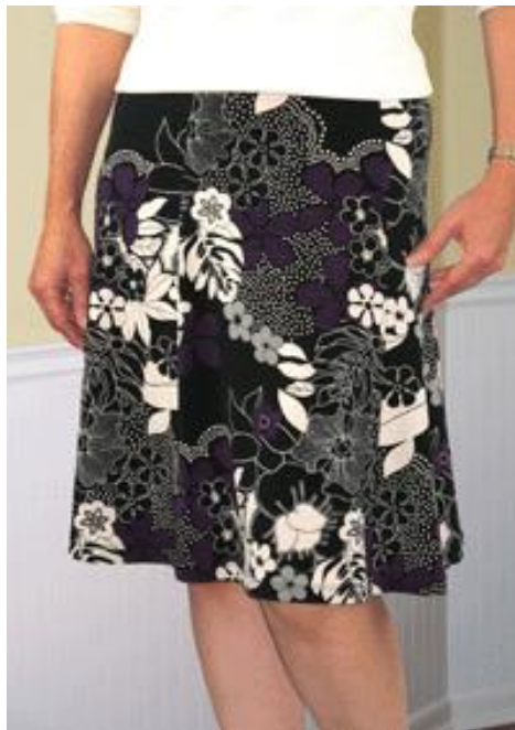
Zinfandel Skirt by Brensan Studios

If you've been in the Store lately, you may have noticed that we rearranged a few things. Please check out our new art supply center. We now carry Paintstiks, metallic Lumiere paints, Lutradur, Angelina fibers and films, beads, fibers, foil and adhesives. Samples are being made and an embellishment class utilizing many of these is scheduled for September 27.