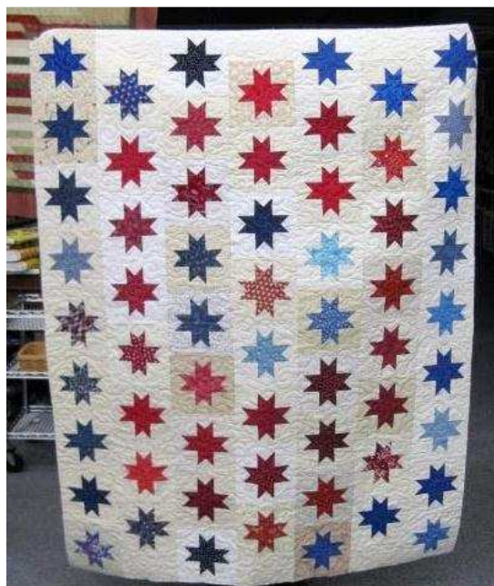
Our "Just One Star Project" Quilt