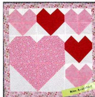
Snap Sack “Sweethearts” Cost $14.99