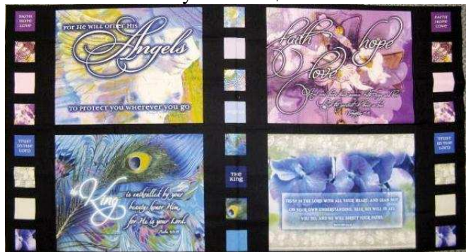
Beautiful Blessing Bright panel. Cost $7.99