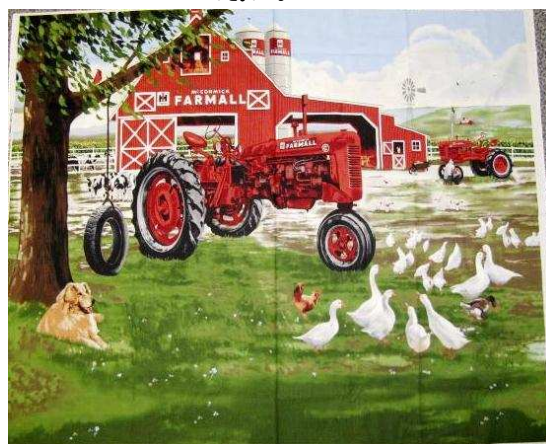
Farmall Tractor Panel Cost $12.99