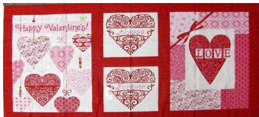
Always and Forever Panel. Cost is $7.99