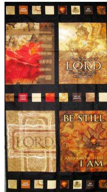
Beautiful Blessings Earth panel. Cost $7.99

If the Plattsburgh Schools are closed due to weather, we will also be closed.