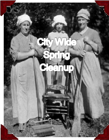
City Wide Spring Cleanup