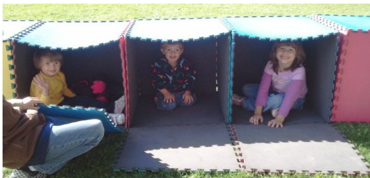
Just some of the fun we had!