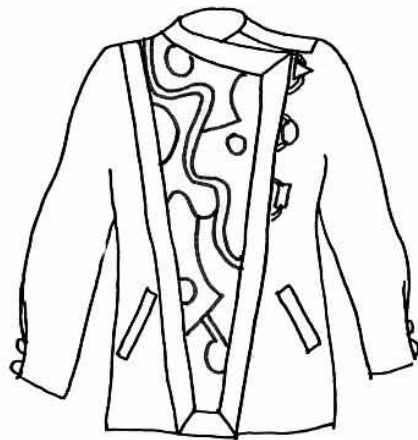
Curved seam piecing with appliqué